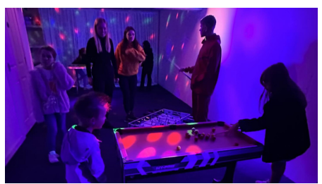
Our monthly Youth Club