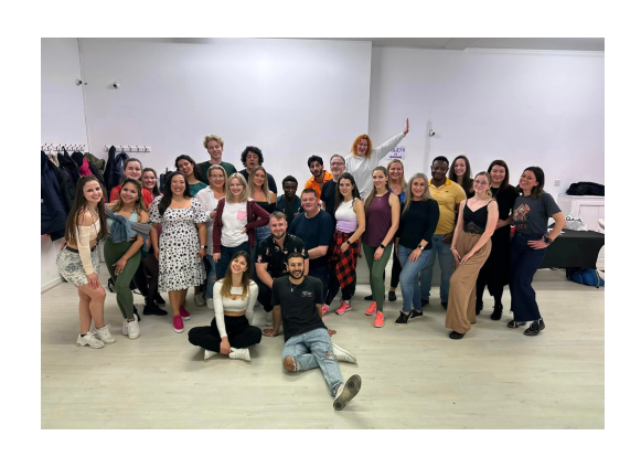
IL Fusion ended their 6-week dance bootcamp with a workshop with guest teachers from Manchester.